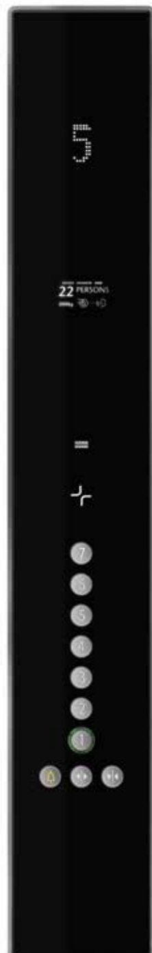
Card reader integrated with KSC D23 car operating panel

Our user-friendly, integrated access and destination solutions are designed to make it easy for people to move throughout your building.