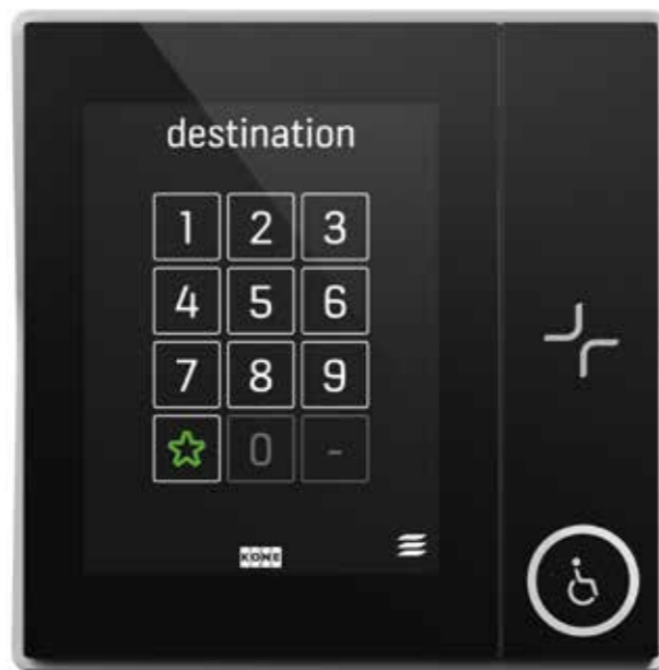
Card reader integrated with KSP 858 touchscreen destination operating panel