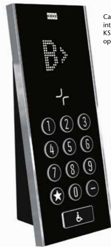
Card reader integrated with KSP 853 destination operating panel