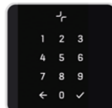
Card reader with PIN