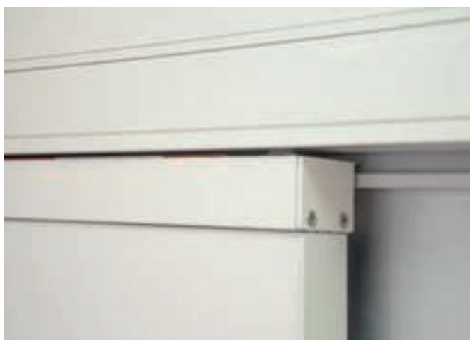
Top door leaf connected to operator