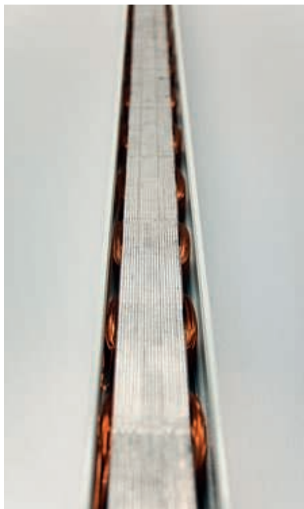
Linear motor inside operator