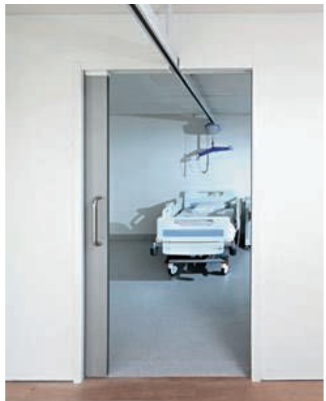
KONE manual gliding door integrated with a patient lifting system